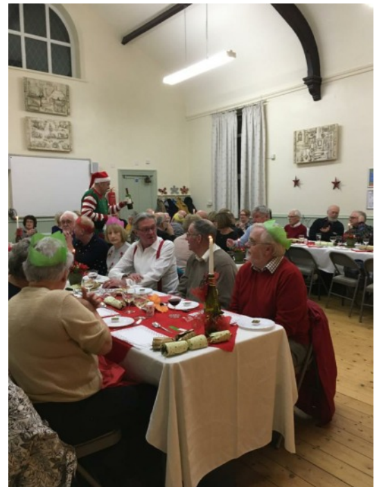
A good time was had by all at the Seniors Christmas Party at the Village Hall (more photos on page 4)